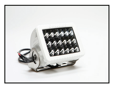
GXL PERFORMACE LED Marine Grade Floodlight 4422 (White)

Package Includes: Mounting Hardware Rockguard