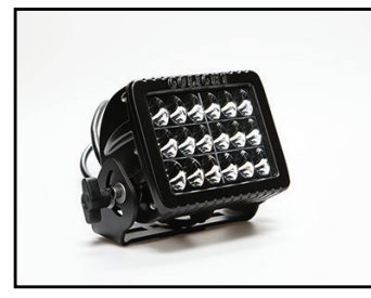
GXL PERFORMACE LED Floodlight 4421 (Black)

Package Includes: Mounting Hardware Rockguard