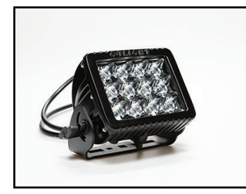
GXL PERFORMACE LED Spotlight 4411 (Black)

Package Includes: Mounting Hardware Rockguard